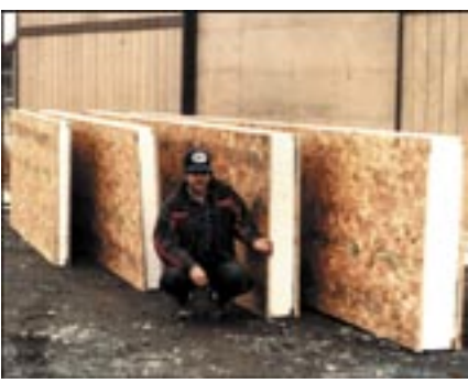
Unlike some structural insulated (SIP) panel systems, the ThermaSave panels vary in size, including both length and thickness, to meet the structural requirements of the building.