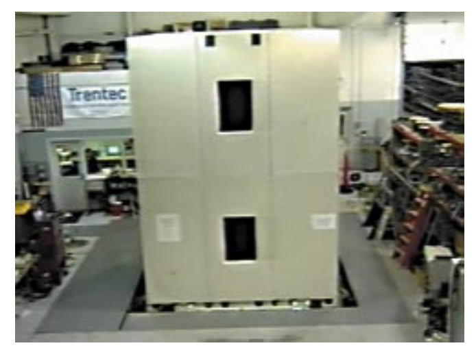
Two-story model ThermaSave panel structure couldn't be damaged by the shake test at the Trentec Lab in Cincinnati, OH.