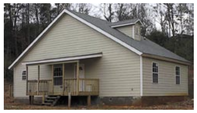
This home in Birmingham was built in 1998 and shows roof panel components clearly. Panels are light in weight and easily assembled.

cut costs while improving quality. The cementitious panel can do that. There have been problems with OSB (SIPs) when they get wet, but this panel is coated at the factory. We've run it through all kinds of moisture penetration tests without problems.