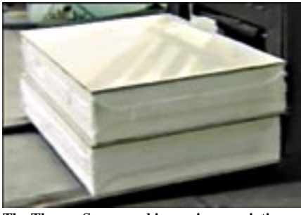
The ThermaSave panel is a unique variation on the SIP, with cementitious skins, patented spline system for assembly and glueing under pressure.